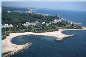
Romanian Black Sea coast (Cape Aurora)