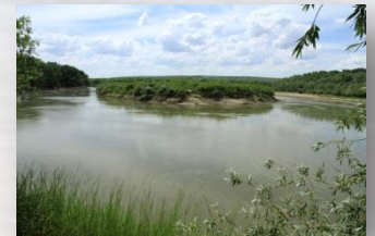
Prut Valley (Moldova)