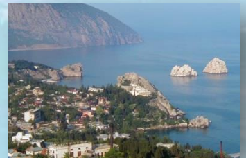
Ukrainian Black Sea coast (Yalta)