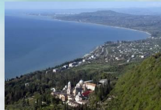
Georgian Black Sea coast (Sukhumi)

Municipalities and regional authorities within the Black Sea region; Black Sea NGOs (Black Sea NGO Network); environmental and socio-economic research institutes; tourism industry actors (hotels, restaurants, cafeterias, national and international travel offices and tourist agencies, project developers, beach operators); general public; Black Sea Commission and its Permanent Secretariat.