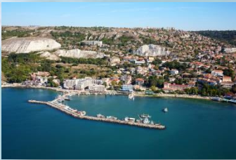
Bulgarian Black Sea coast (Balchik)

Black Sea municipalities and regional authorities of all Black Sea countries; Black Sea environmental, economic and tourism NGO's; central, regional and local governments of the Black Sea countries involved in tourism within the Black Sea region including coastal zones, environmental protection and economic development; Black Sea and European society (public awareness of Black Sea regional environment and sustainable tourism); Black Sea Commission and its Permanent Secretariat, Black Sea public administrations involved in local, regional and integrated tourism management, water quality and tourism development; national tourism information providers; tourism industry (tour operators, tourist agencies, travel offices, hotels, restaurants etc.).