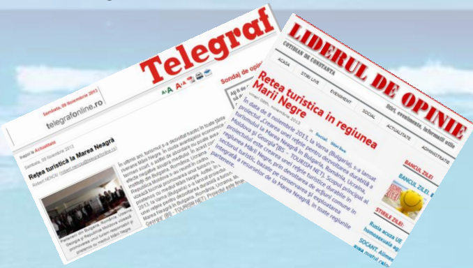
Partners at the Kick-off meeting, Varna, 8-9 November 2013

By the end of the kick-off meeting, a detailed working plan for the first project semester was set. In addition, financial issues, eligibility of costs, declarations, reports etc. were discussed.